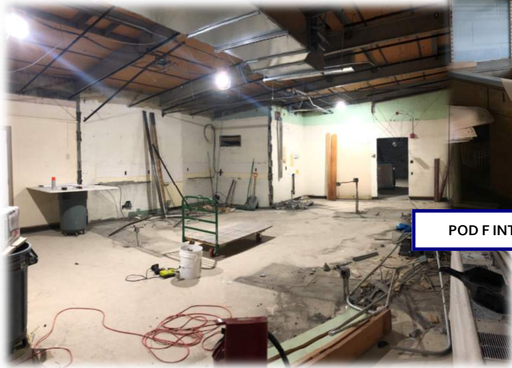
POD F INTERIOR DEMOLITION