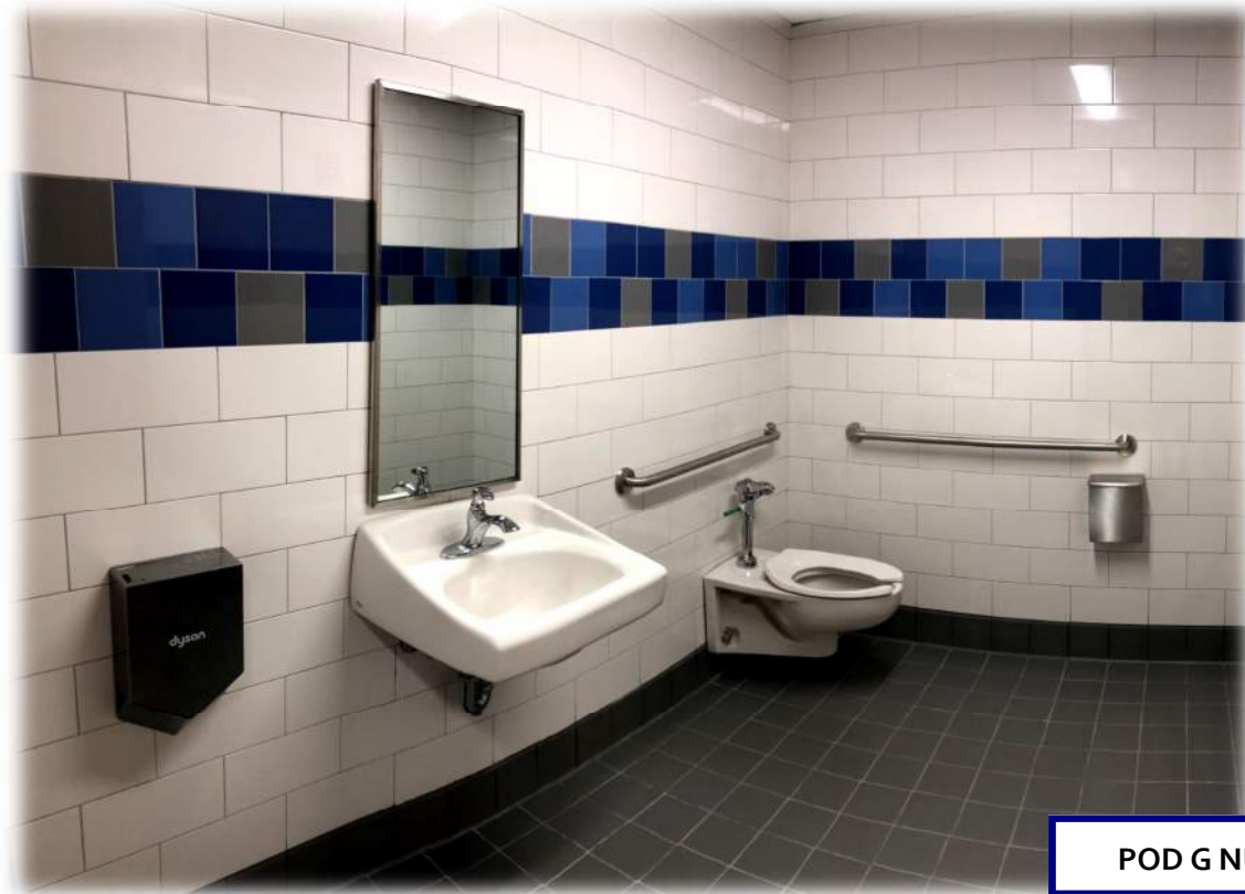
POD G NURSE'S SUITE