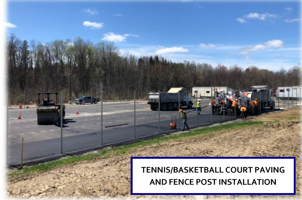
TENNIS/BASKETBALL COURT PAVING AND FENCE POST INSTALLATION